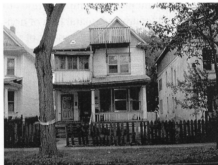
Examples of housing in disrepair in areas termed inner city neighborhoods.

Aboriginal families led by single mothers fare the worst. The income of female, one-parent, no-earner families on government assistance fell from $15,408 in 1993 to $13,373 in 1997 with the deterioration of the "social safety net." Manitoba has the highest female poverty rates in Canada, with 40% of the general female population experiencing poverty. The link between poverty, gender and being Aboriginal is worrying. Aboriginal